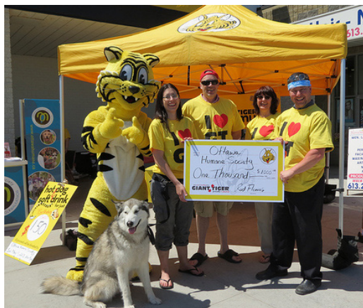
Team F.I.D.O., shown here, raises money for OHS animals by selling calendars, hosting barbeques, and silent auctions.

We raise money by selling a calendar, hosting barbeques, and silent auctions. This year we'll also run a garage sale with all the funds going to the OHS.