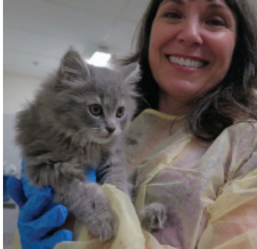
Staff and volunteers are working hard to provide hundreds of orphans a second chance.

The summer is the busiest time of year at the OHS, with stray or abandoned cats arriving by the boxful in need of help. To help cope with the growing demand, the OHS launched the Kitten Brigade program last year — a fast-track foster initiative that boosts our number of foster homes and places some of our most vulnerable cats and kittens into temporary homes as soon as possible. Thanks to you, we helped close to 120 cats and kittens through this program last summer, and this summer we hope to help even more.