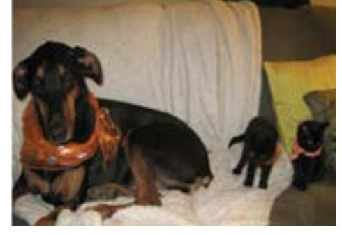
Sweetie Pie, Nutmeg and Pepper

Through the foster program, I've seen firsthand the comprehensive care that the OHS provides, with enthusiasm and compassion. Ottawa is fortunate to have strong community support for our animal shelter – financially, and with volunteers and local media. Many shelters simply cannot invest the veterinary care, the medications, the surgeries and the behavioural training that makes many animals adoptable.