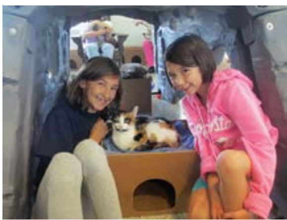
Changing the future for animals with humane education

Visiting classes will be provided with an informative presentation in the OHS's Education Centre followed by a hands-on experience with temperament-tested companion animals. Students will then